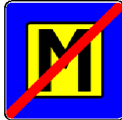
II 21b Koniec úhrady mýta