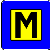
II 21a Úhrada mýta